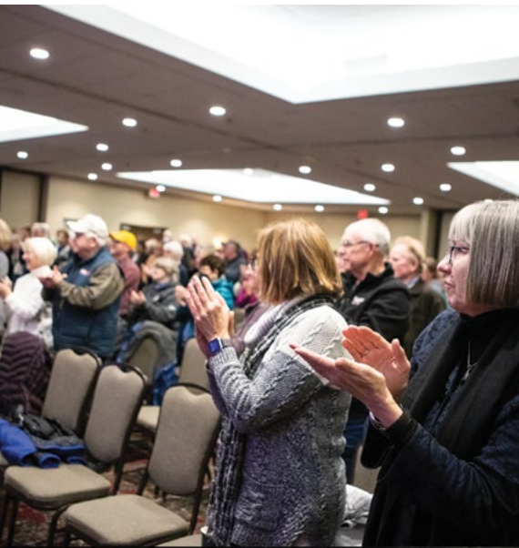
The crowd at the event giving the women of the Willmar 8 a standing ovation.