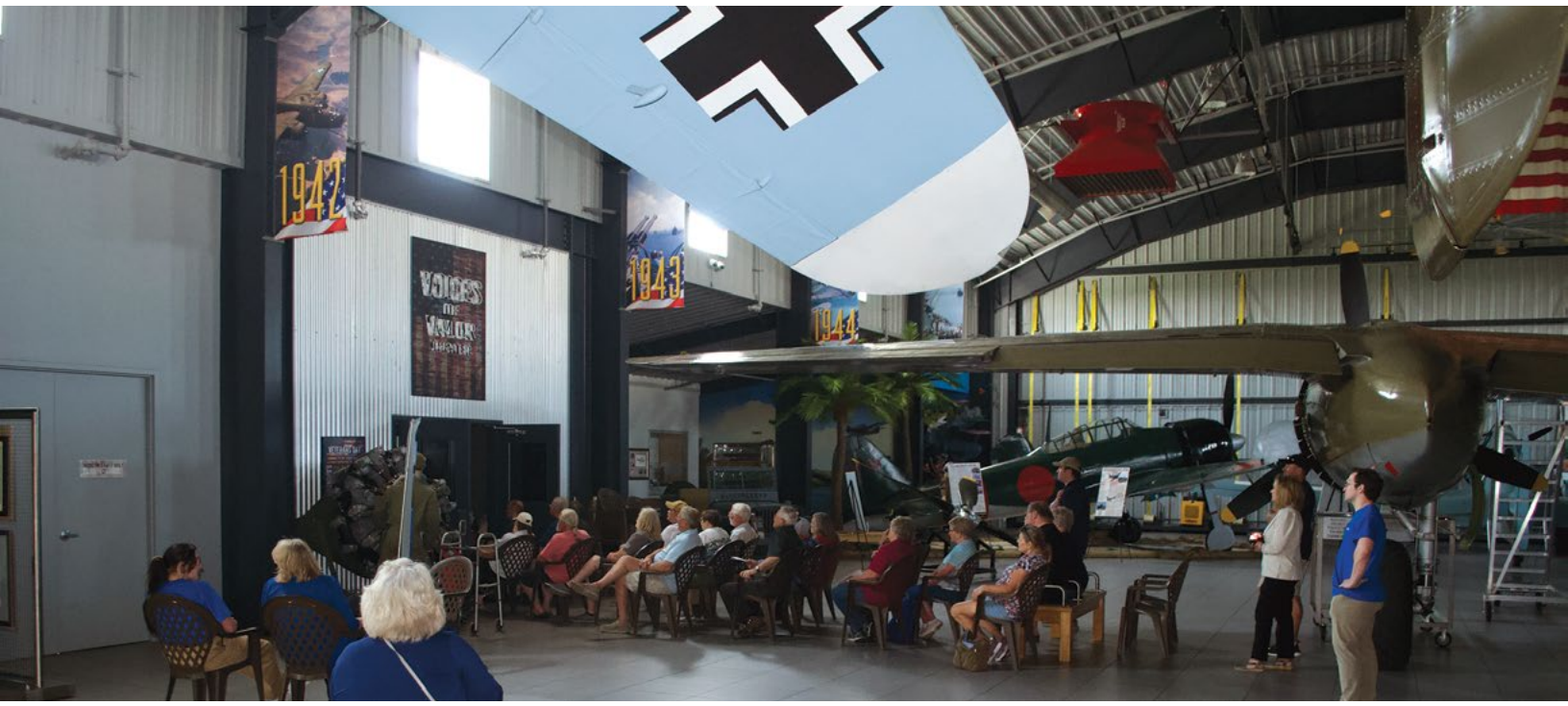
Special event and screening of Remembering WWII: Heroes & History at Fagen Fighters WWII Museum