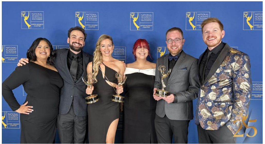
The Upper Midwest Regional Emmy Award-winning teams from Pioneer PBS