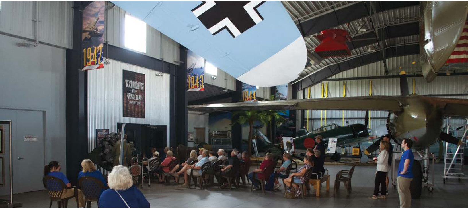
Special event and screening of Remembering WWII: Heroes & History at Fagen Fighters WWII Museum