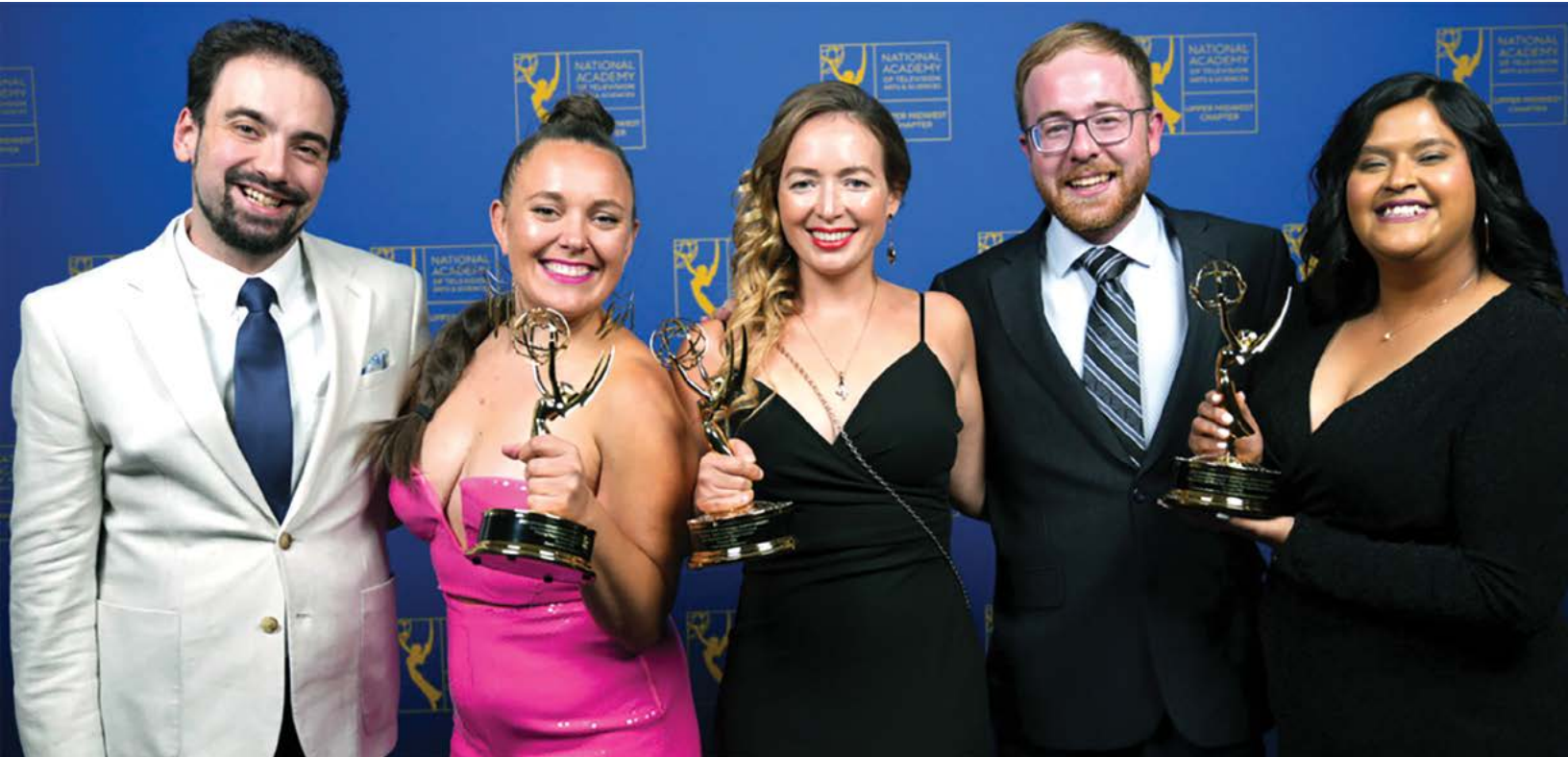
Pioneer PBS received nominations for 22 Upper Midwest Regional Emmy® awards for 2023, bringing home three Emmy awards.