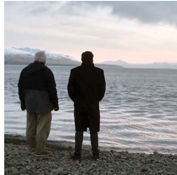
"Playing Haydn for the Angel of Death"

“The programming on Pioneer PBS focuses on the stories about our region and rural area. It educates viewers of all ages. ”