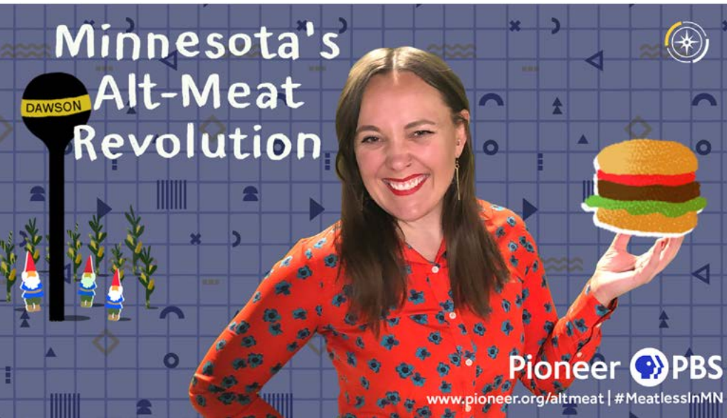
"Minnesota's Alt-Meat Revolution" digital-first series

Pioneer PBS is showcasing our regional voices to an international stage, raising this region's voices to the world.